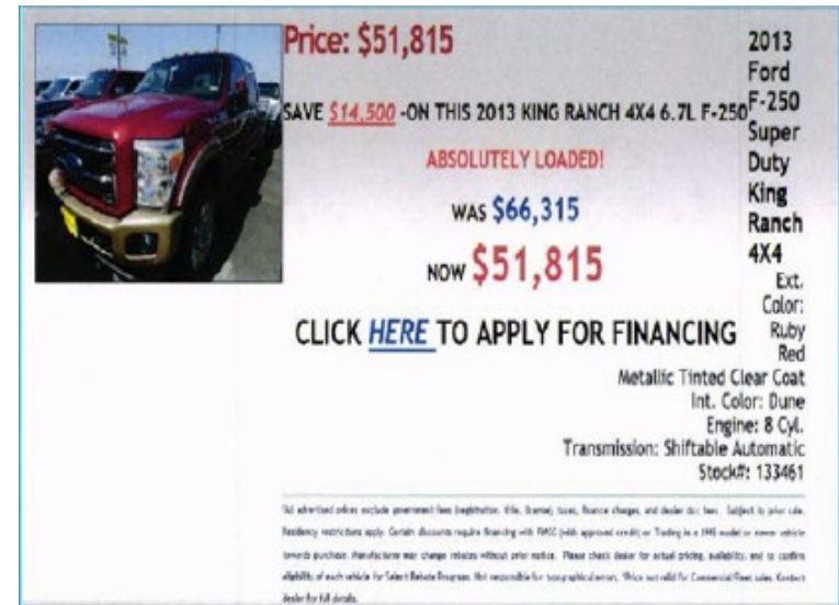
Used 2013 Ford F-250 SuperDuty King Ranch

These terms cannot be used. The ad implies an advertised savings on a used motor vehicle.